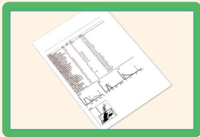
■ Report with complete information.

2728 S. La Cienega Blvd., Los Angeles, CA 90034 www.labomed.com spectro@labomed.com