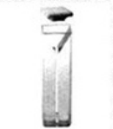
Micro cell with frosted walls and lid

Q = Quartz / Cells for 190-2500nm / G = Optical Glass / Cells for 320-2500nm