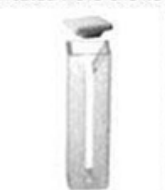
Micro cell with frosted walls and lid

Q = Quartz / Cells for 190-2500nm / G = Optical Glass / Cells for 320-2500nm