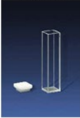
Standard fluorimeter cell with lid

Q = Quartz / Cells for 190-2500nm / G = Optical Glass / Cells for 320-2500nm