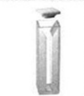
Micro cell with frosted walls and lid

Q = Quartz / Cells for 190-2500nm / G = Optical Glass / Cells for 320-2500nm