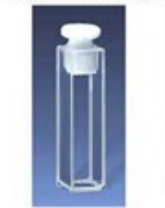
Standard fluorimeter cell w/ teflon stopper

Q = Quartz / Cells for 190-2500nm / G = Optical Glass / Cells for 320-2500nm