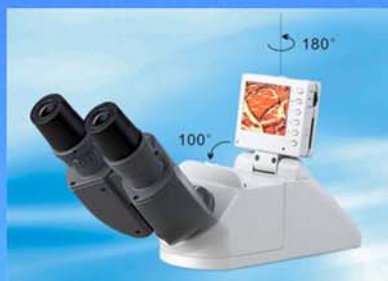
Swivel Head LCD