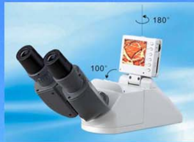
Swivel Head LCD