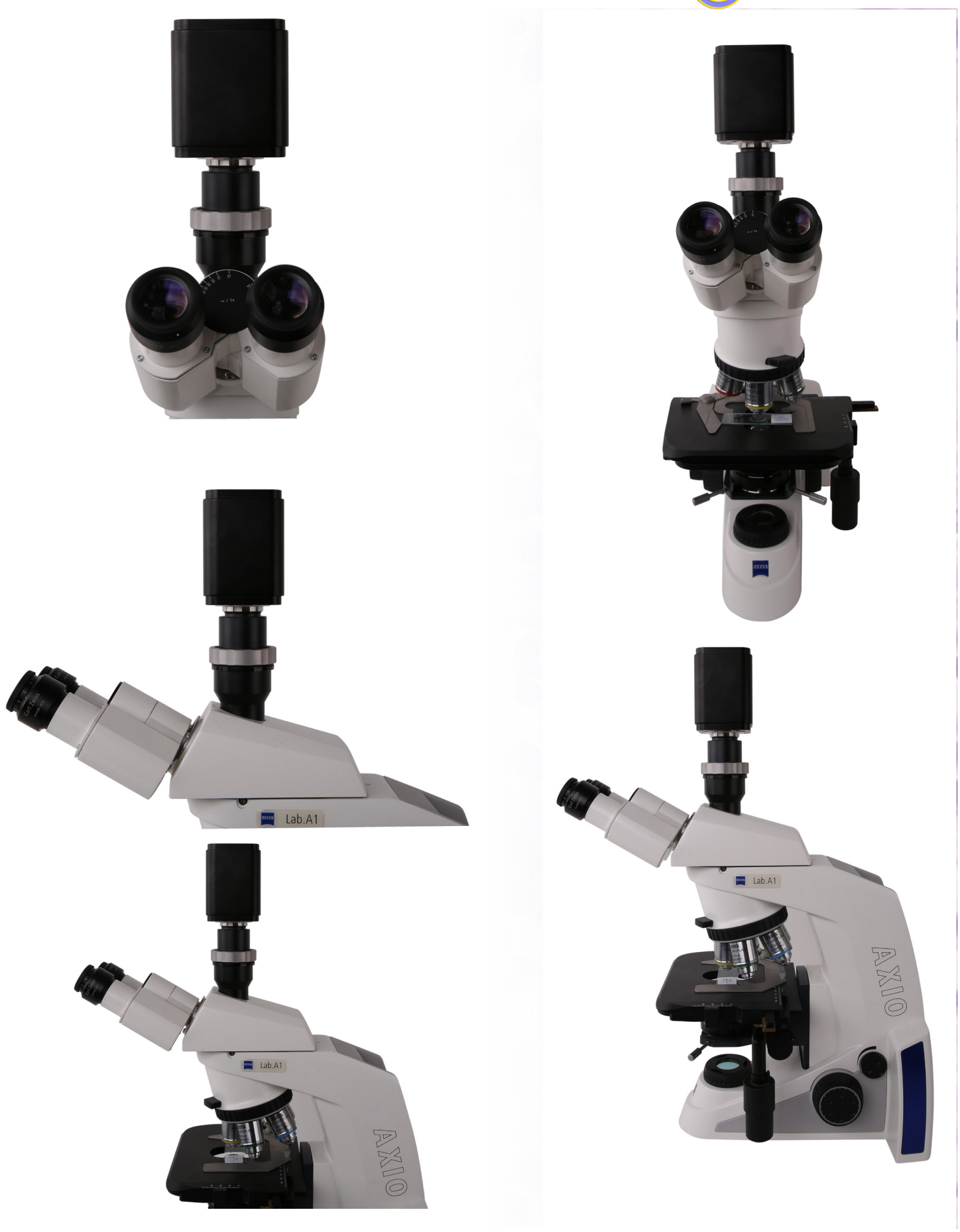
LC-31 and Zeiss Microscope